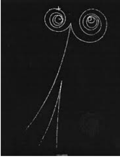
Figure 2: Trace of a positron in a cloud chamber. In a sealed vessel, filled with vapor, highly energetic photons create electron-positron pairs; a strong magnetic field is made present, due to which the positron and the electron each make a curling movement in opposite direction. The interaction with the vapor in the vessel then makes a trace visible: the trace on the upper right is then caused by a positron.