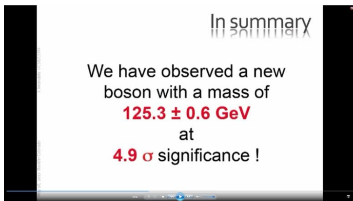
Figure 1: Slide shown at a press conference at CERN in July 2012.

boson (CERN, 2013). The leading journals Science and Nature hailed the discovery of the Higgs boson as the “Breakthrough of the Year” (Cho, 2012) and “the biggest particle-physics discovery in a generation” (Chalmers, 2012). In addition, the 2013 Nobel prize for physics was awarded to Peter Higgs and François Englert “for the theoretical discovery of a mechanism that contributes to our understanding of the origin of mass of subatomic particles, and which recently was confirmed through the discovery of the predicted fundamental particle” (Nobel Media AB, 2013).